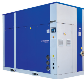
Electric Screw Compressor