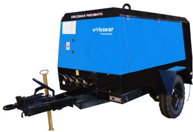
Diesel Portable Compressor