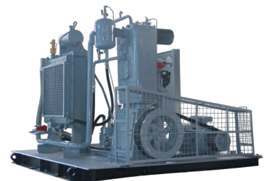
Vertical Reciprocating Compressor